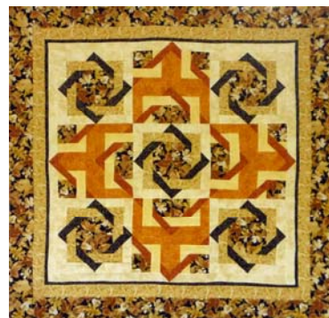
One Focal fabric, two Darks (B & E), two Medium/Light (C & F), two Medium/Light (D & G) background