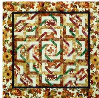
One Focal fabric, one Medium/Light (D) background (yardage from one color way), two Darks (B & E), two Medium/Light (C & F)