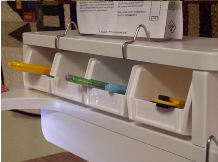
See and Sew LED Light with Storage By RoBo Whittler, LLC.