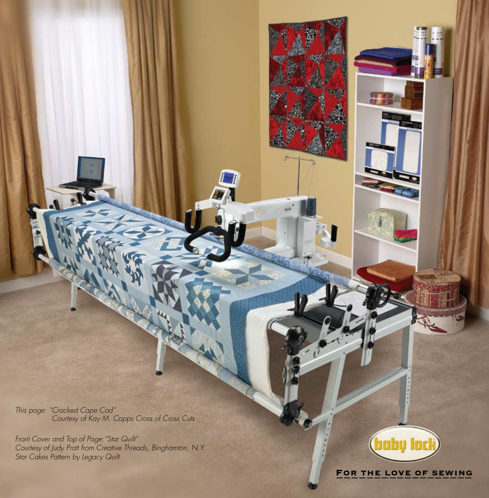
This page: "Cracked Cape Cod" Courtesy of Kay M. Capps Cross of Cross Cuts