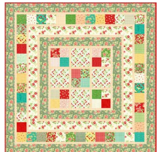
Fig Tree Club: Join our second annual Fig Tree Club, a quarterly club for all our fans of Fig Tree Quilts! Each quarter you will receive an exclusive pattern and quilt kit available only to club members. Projects will be simple and will include lap quilts and table toppers. Quilt kits will include the exclusive Fig Tree Quilts Pattern and yardage to complete the quilt top and binding.

Tue 6/7, 7/5, 8/2, 9/6 10 a.m. or 6 p.m. Alison Dale $20