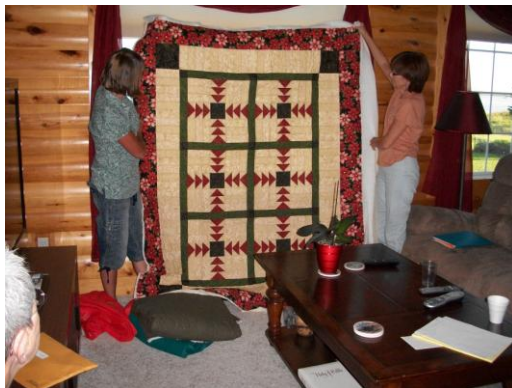
Sue LaFleur made a pretty Christmas quilt with lots of flying geese in it!