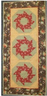
Table Runner of the Month - Pinwheels on the Run

This bag has two sizes available. You will learn to make a welted pocket on the front that is perfect to slip your cell phone and keys into for a quick grab.