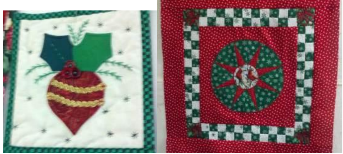
Mug rug and paper piecing.