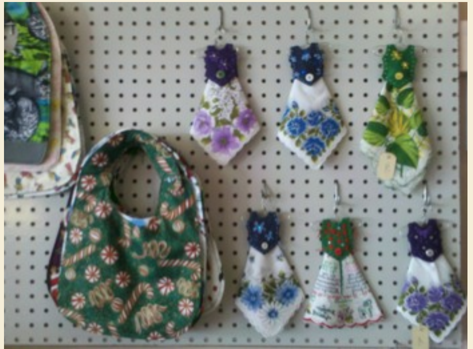
Silk Ribbon Embroidery Handkerchief Dress Wall Hangings you can make during a class at Hyderhangout.

Many new activities and classes are available at Hyderhangout. The Art Quilter's Exploration Group meets every third Wednesday of each month, beginning January 19th. The purpose of this group is to explore alternative techniques in fiber arts. Other new classes include the Polymer Clay Quilt