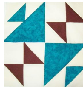
School Girl's Puzzle