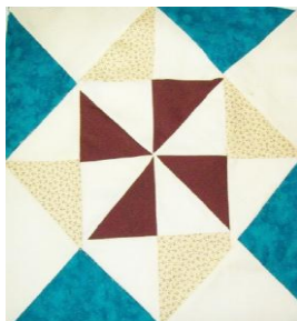
Peace & Plenty