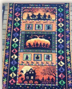
Tricks & Treats

Kit $79.99 Includes pattern and fusible tape