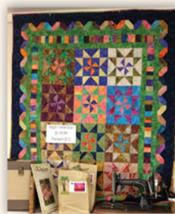
Night and Day