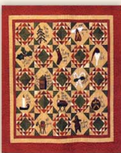
Home for the Holidays

by Jinny Beyer 91 x 91 $199.99 Includes pattern