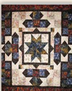
It's About to Get Western