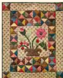
Garden Path Mini

16" x 20" $27.99 from the book Fat Quarter Quilting by Lori Smith