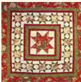
Bread and Butter Holiday Kit

72" x 72" $149.00 from the book Scrap Quilts go Country by Deanna Eiseman