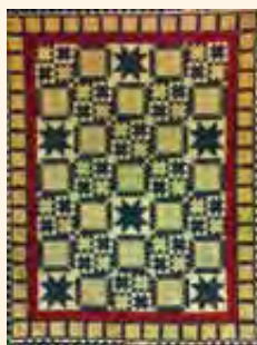
Once Upon a Time

Kit w Pattern $69.99 Pattern only $10 56x72