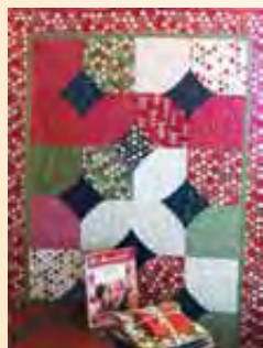
Countdown to Christmas

Sampler Club meets on the 2nd Tuesday of each month at 6pm. Club is for any brand of machine owner who wants to learn new techniques and more about what their machine can do. It is a lecture/demo format that showcases all types of sewing; home dec, quilting, crafting, clothing, embroidery and more. If you have purchased your machine at the Quilt Sampler your 1st year is free. We have a fun, talented group of ladies who attend club. Their show-n-tell is the best! We would love to have you be a part of Sampler Club. If you have never been before the first time is free! The cost is only $55 a year. That is only $5 a month, Jan-Nov. Sampler Club members get 20% off any regular priced items in the store on club night.