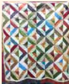
Pick up Sticks