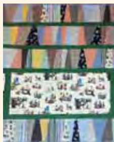
Picnic in Pleasantdale

Kit inc pattern $167 Pattern only $8 76x 97