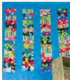
Mumbo Jumbo flannel

Kit $48.99 Book $18.50 Brambleberries Kit inc pattern $165 80x90