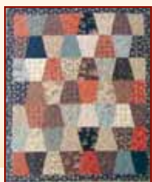
A Simpler Time Flannel Quilt 72" X 92" $109.00 includes pattern Plexiglass template $26.00