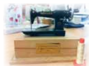
Bernina 75th anniversary music box. Limited availability $35