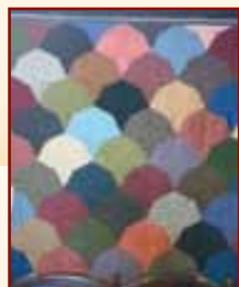
76 Clambones 82 x 96 Kit $189 includes pattern