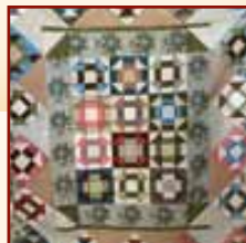
Antebellum Kit with pattern $130.50