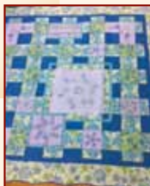
Chloe 72x72 Kit $109.99 Embroidery CD $99 Thread Kit $34.95