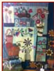
Farm Fresh 68 82 Kit $194.99 Book $24