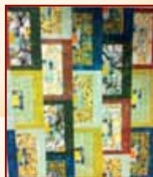
Magnolia Lane 63x73 What fun fresh fabrics! This quilt was fun and easy to make!