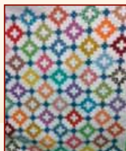
Amber Waves of Grain Kit 104.00 52x66 30's prints never go out of style!