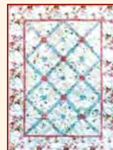
Memories of Love 75" x 95" $110.00 From the book Cottage Stars $10.00