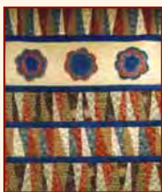
Pretty Posies 48" x 54" $65.00 From the book Fab Five $18.50