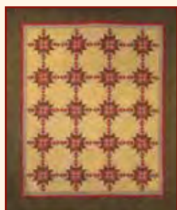
Pony Bob's Crazy Ride 73" x 94" $99.00 Uses Square in a Square Technique From the book Square in a Square 10th Anniversary Edition $29.99