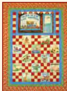
Wind it up Toy Shoppe 42" x 58" $49.99 Pattern Included