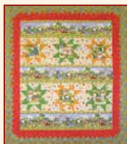
Rhyme Time Stars 54" x 63" $65.00 Pattern Included