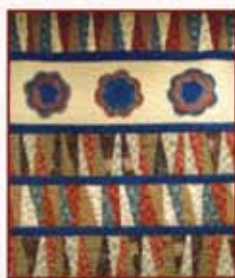
Pretty Posies 48" x 54" $65.00 From the book Fab Five $18.50