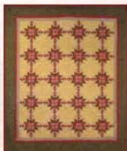
Pony Bob's Crazy Ride 73" x 94" $99.00 Uses Square in a Square Technique From the book Square in a Square 10th Anniversary Edition $29.99