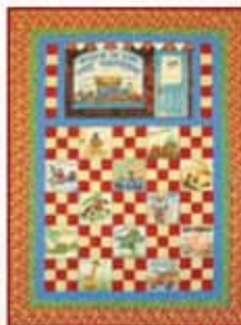
Wind it up Toy Shoppe 42" x 58" $49.99 Pattern Included