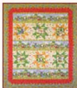
Rhyme Time Stars 54" x 63" $65.00 Pattern Included

Vicki Bellino and Marcus Fabrics have joined forces to bring us a beautiful Christmas Block of the Month. Vicki's creative use of the Strip-It fabrics creates half-square triangles in a fraction of the time. This quilt uses easy piecing and is perfect for all skill levels. The quilt finishes at 62" square and is $25.00 per month for six months.