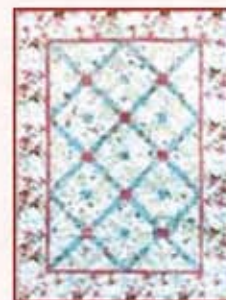
Memories of Love 75" x 95" $110.00 From the book Cottage Stars $10.00