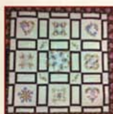
Floral Visions CD $99 Kit with pattern $89.99