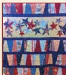
Fab 5 Kit $65.99 Book $18.50