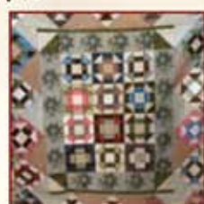
Antebellum Kit with pattern $130.50