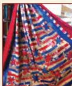
Americana Kit $65 Backing $42 Book $29.95