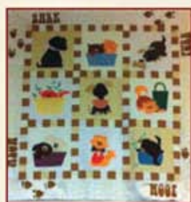
Furry Sweetness Kit with pattern $80