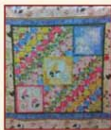
Botanical Blooms Kit with pattern $99