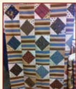
Village Cookies Kit $60 Book $16.95