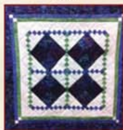
Ambrosia Kit with pattern $29.99 Pattern only $5