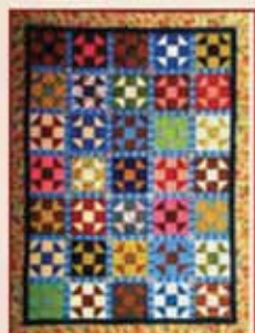
Kaye England's Lightly Toasted 63 x 84 $69.99