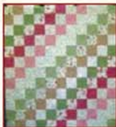
Floral Medley (the Spring version of Warm Woolen Mittens!) 66 x 72 $69.99