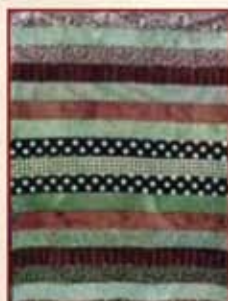
Minkie Kits come in a variety of combinations 60 x 72 $125.00 or 54 x 60 $75.00