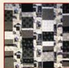
April in Paris 60 x 81 $75.00