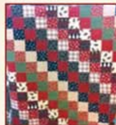
Warm Woolen Mittens 66 x 72 $69.99