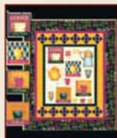
Daily Grind includes 4 bonus potholders 36 x 43 $40.00