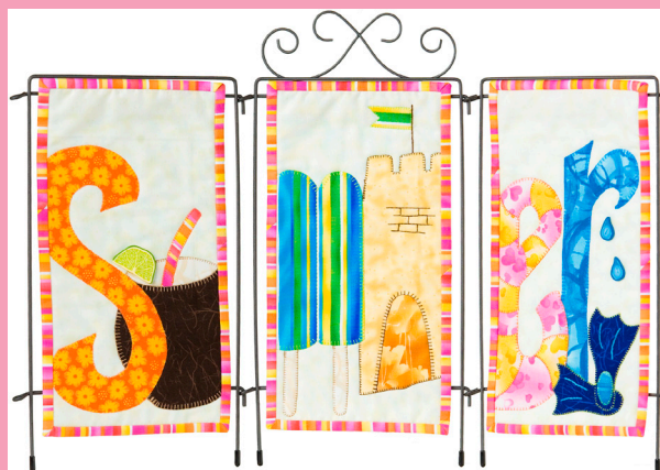
P124 Summer Time Fun 6" x 11½" (each sect.)