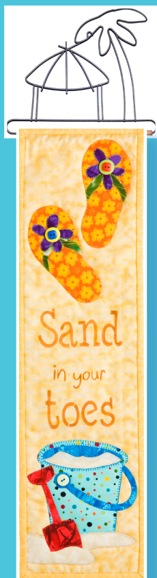
P122 Sand in your Toes 6" x 22"