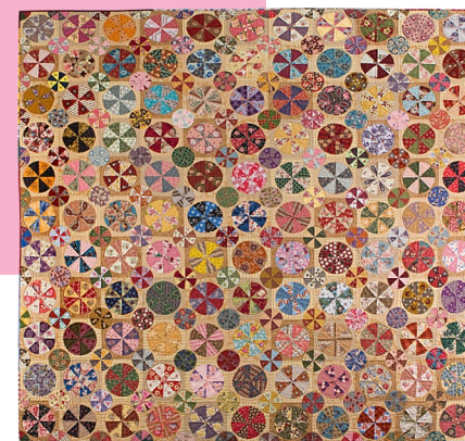
Pie and Tarts

Patchwork with Busyfingers Eumundi, Australia