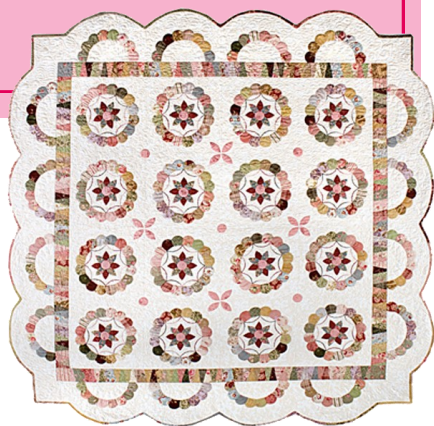
It Takes Two

Tickets for the trunk show are available at Merry's Stitchins. Price of $10 includes dessert and a $5 coupon toward Sue's patterns, papers, or notions.