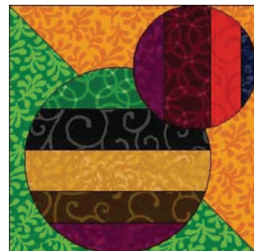
Example of Finished Block

12. From 466RO, cut (6) 2 1/4" binding strips. Sew the strips end to end. Use the long strip to bind the edges to finish.