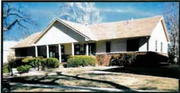
304/306 N Walnut Street