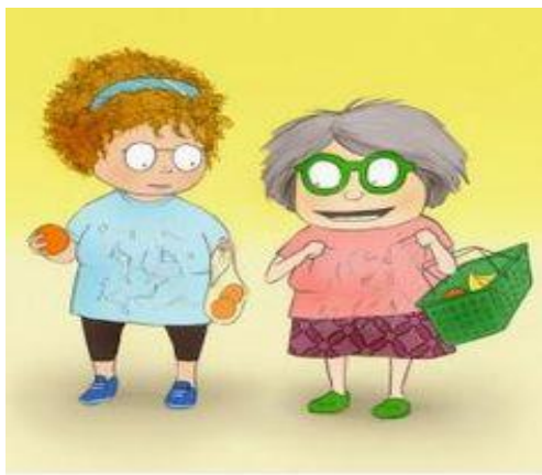
I can tell you're a quilter by the threads on your shirt.

“Bar Gello? Is this some sort of exclusive nightclub for quilters?”