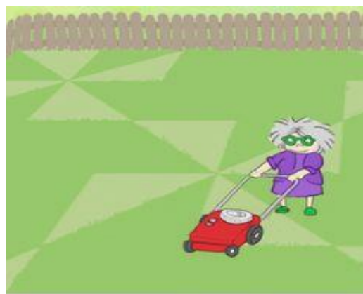
Why quilters are rarely asked to mow the lawn.