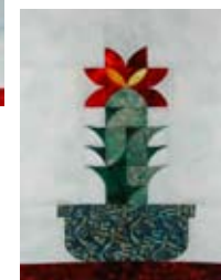
Crown of Thorns